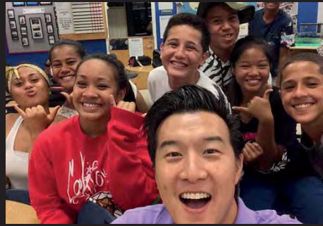
Linsanity producer and Hawaii Five-0 actor Brian Yang promotes Youth Voices at Oahu's Waianae High