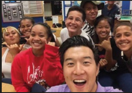
Linsanity producer and Hawaii Five-0 actor Brian Yang promotes Youth Voices at Oahu's Waianae High